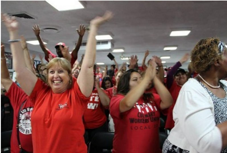
Candidate Believes in Empowering the Working Families of Wisconsin.