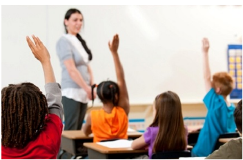
Republicans in the state Assembly passed legislation Tuesday that would make most private school students eligible for a taxpayer-funded tuition subsidy.

Written by WisDems Press Friday, 25 February 2022 10:25 -