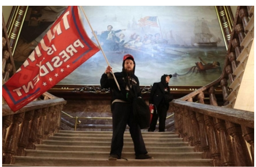
Two Republicans who have been subpoenaed by Congress for their role in posing as fake electors met with Kleefisch and Nicholson campaigns.

Written by WisDems Press Friday, 04 February 2022 15:10 -