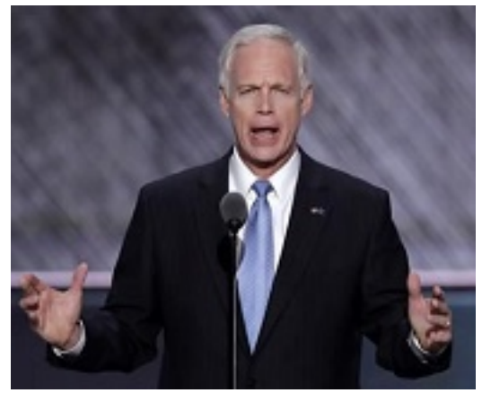
"As President Trump launched attack after attack on longstanding environmental protections, Senator Ron Johnson refused to stand up for Wisconsin's air, water, land and wildlife," said

The Scorecard is the primary yardstick for evaluating the environmental records of every member of Congress, and is available for download at scorecard.lcv.org.