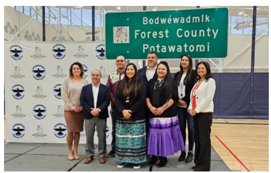
The new Tribal boundary signs feature the Forest County Potawatomi Tribal seal next to the Tribe's name, "Bodwéwadmik." Pronounced Bo-dwa-wah-meek, Bodwéwadmik is the traditional name for the reservation, which means "Keeper of the Fire."

MADISON — Gov. Tony Evers today celebrated the newest set of dual-language highway signs unveiled for placement on state highways as part of the Wisconsin Department of Transportation's (WisDOT) Dual-Language Sign Program. The new signs indicate the Forest County Potawatomi Community's Tribal boundaries and two creeks in both the Potawatomi and English languages.