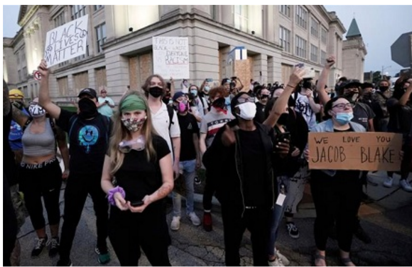
Do not allow the actions of a few distract us from the work we must do together to demand justice, equity, and accountability, says Governor.

Written by GOV Press Wisconsin Tuesday, 25 August 2020 15:25 - Last Updated Saturday, 29 August 2020 09:33