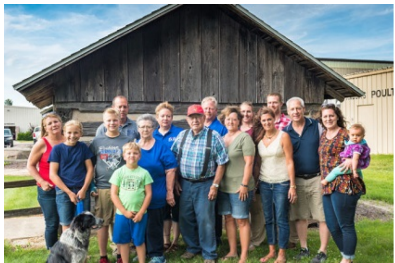
State Senator says family farms are Wisconsin's legacy and makes proposals to better address the real issues that our rural communities are facing.

Written by Jon Erpenbach Press. State Senator 27th District Friday, 31 January 2020 10:43 -