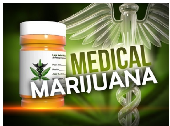
We should legalize medical marijuana, as an ever growing list of organizations and individuals support decriminalization for medical use.

Written by Jon Erpenbach Press. State Senator 27th District Tuesday, 19 February 2019 11:15 -