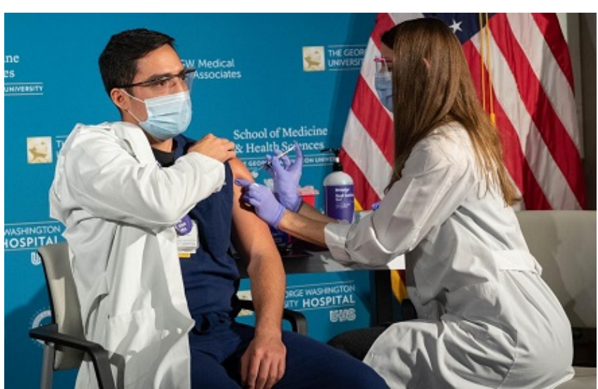
State will follow federal guidance on who gets the vaccine and when, starting with frontline healthcare workers and other essential services.

Written by GOV Press Wisconsin Friday, 18 December 2020 15:53 - Last Updated Saturday, 19 December 2020 16:38