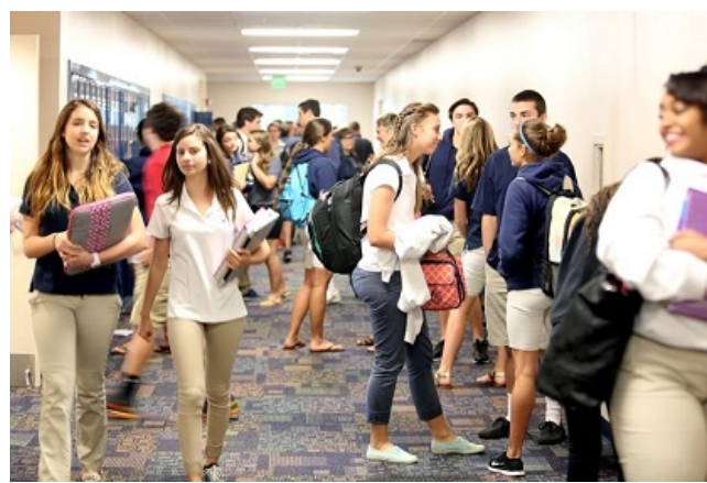
Sign up for a week-long educational program offered by the Wisconsin State Senate to provide high school students with a up-close view of the Wisconsin Legislature's role.

Written by Calab Frostman, State Senator District 1 Saturday, 29 September 2018 10:39 - Last Updated Saturday, 29 September 2018 11:21