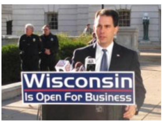
'Gold Standard' jobs report exposes weakening economy and declining wages as many good-paying jobs are leaving Wisconsin.

Written by Wisconsin Senate, Tony Palese Wednesday, 07 June 2017 12:59 -