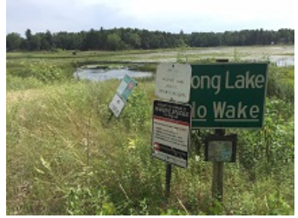
I pledge to protect Wisconsin's lakes, rivers, and wetlands.