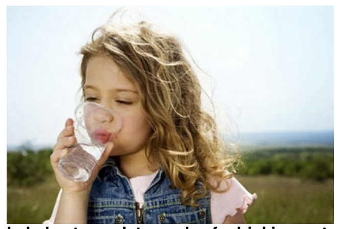
I pledge to work toward safe drinking water and healthy air for all Wisconsinites.

Now, at 100 days in office, Wisconsin Conservation Voters reviews the progress the Evers Administration is making on the pledge.