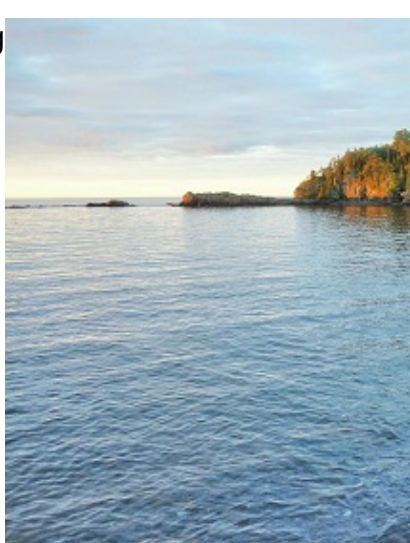
$4.1 million will support the Gile Flowage Land Conservation Project in Iron County. The remaining $500,000 will support the Creating a Resilient and Sustainable Valley Creek Corridor project in Port Washington.

http://newiprogressive.com/images/stories/S5/lake-superior-coast-s460.jpg