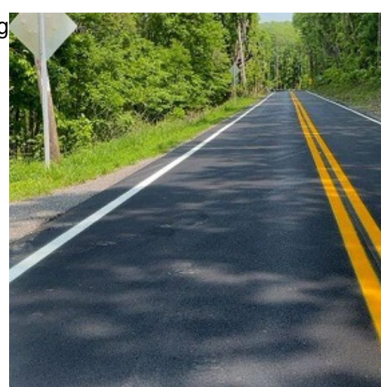
Lightly traveled routes feature Northwestern forests, Southeastern rural history.

http://newiprogressive.com/images/stories/S5/road-rustic-s460.jpg